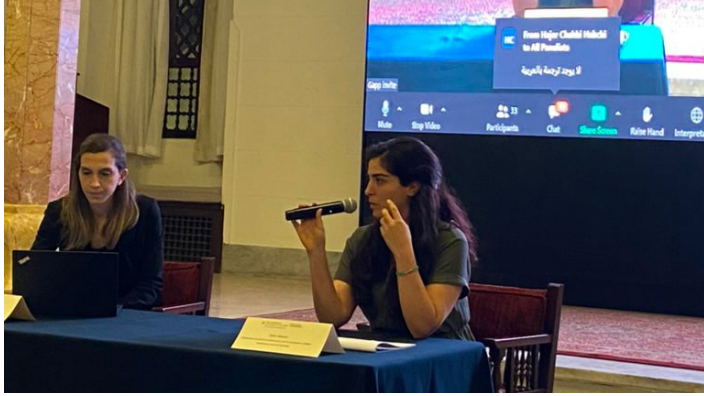
RANS MENA and MENA Statelessness Platform Launch in Cairo, 2021

Message from the Chair | Why RANS MENA | A Discussion with... | Featured Publications