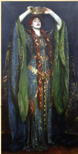
John Singer Sargent, Ellen Terry as Lady Macbeth (1885), Tate Britain

DEPARTMENT OF ENGLISH CENTER FOR ARTS AND HUMANITIES